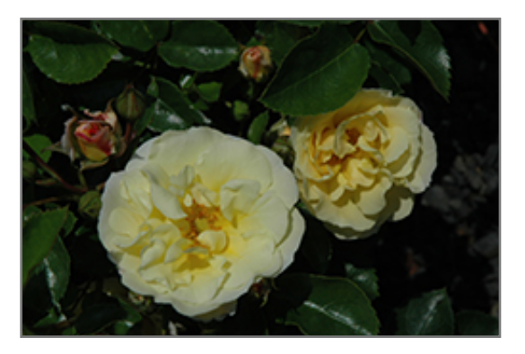
Popcorn Drift Rose flowers

Popcorn Drift Rose is blanketed in stunning creamy white flowers with buttery yellow overtones at the ends of the branches from late spring to early fall, which emerge from distinctive yellow flower buds. The flowers are excellent for cutting. It has dark green deciduous foliage. The glossy oval compound leaves do not develop any appreciable fall color.