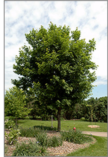
Sugar Maple

* This is a 'special order' plant - contact store for details