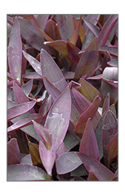
Purple Heart foliage

There are many factors that will affect the ultimate height, spread and overall performance of a plant when grown indoors; among them, the size of the pot it's growing in, the amount of light it receives. watering frequency, the pruning regimen and repotting schedule. Use the information described here as a guideline only; individual performance can and will vary. Please contact the store to speak with one of our experts if you are interested in further details concerning recommendations on pot size, watering, pruning, repotting, etc.