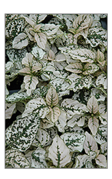
Splash Select White Polka Dot Plant foliage

When grown indoors, Splash Select White Polka Dot Plant can be expected to grow to be about 12 inches tall at maturity, with a spread of 12 inches. It grows at a fast rate, and under ideal conditions can be expected to live for approximately 5 years. This houseplant will do well in a location that gets either direct or indirect sunlight, although it will usually require a more brightly-lit environment than what artificial indoor lighting alone can provide. It does best in average to evenly moist soil, but will not tolerate standing water. The surface of the soil shouldn't be allowed to dry out completely, and so you should expect to water this plant once and possibly even twice each week. Be aware that your particular watering schedule may vary depending on its location in the room, the pot size, plant size and other conditions; if in doubt, ask one of our experts in the store for advice. It is not particular as to soil type or pH; an average potting soil should work just fine.