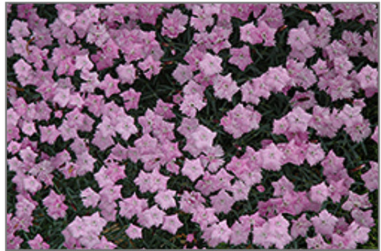
Bath's Pink Pinks in bloom

Bath's Pink Pinks is recommended for the following landscape applications;