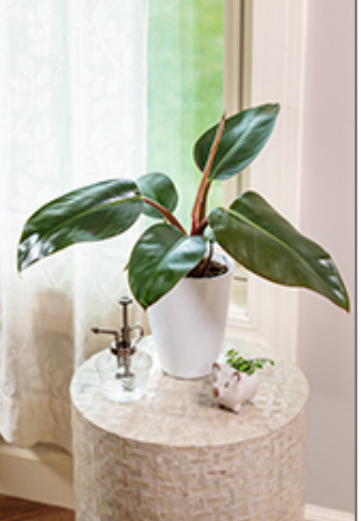
Prismacolor Rojo Congo Philodendron in full