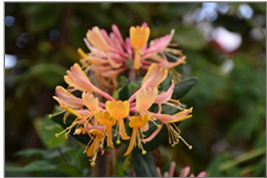
Goldflame Honeysuckle flowers