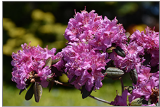
Midnight Ruby Rhododendron flowers