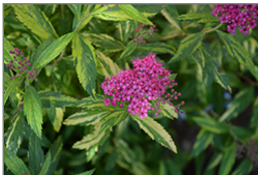
Double Play Painted Lady Spirea flowers