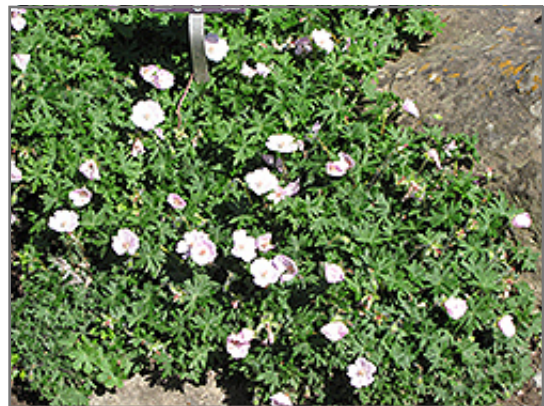
Striated Cranesbill in bloom