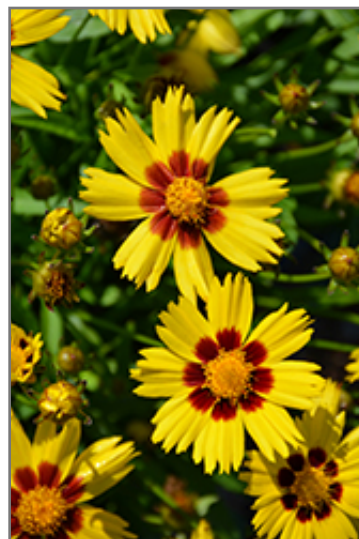
Sunkiss Tickseed flowers