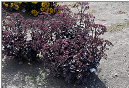
Cherry Truffle Stonecrop in bloom