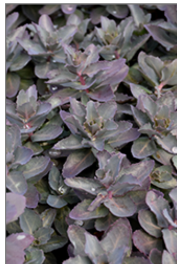
Cherry Truffle Stonecrop foliage

* This is a 'special order' plant - contact store for details