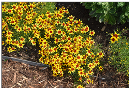
Sizzle And Spice Curry Up Tickseed in bloom