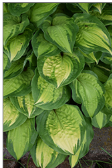
Island Breeze Hosta foliage