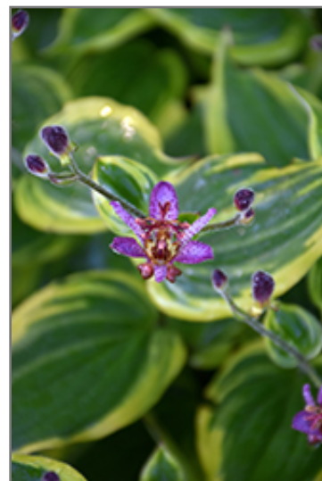
Autumn Glow Toad Lily flowers

Autumn Glow Toad Lily is recommended for the following landscape applications;