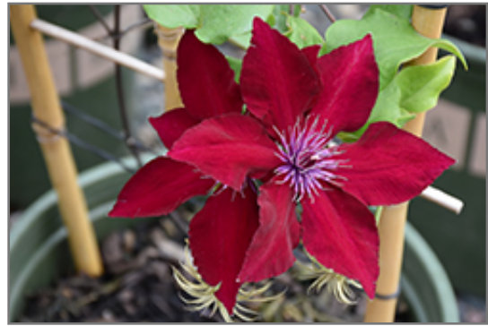
Boulevard Nubia Clematis flowers

Boulevard Nubia Clematis is recommended for the following landscape applications;