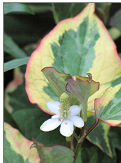
Chameleon Houttuynia flowers