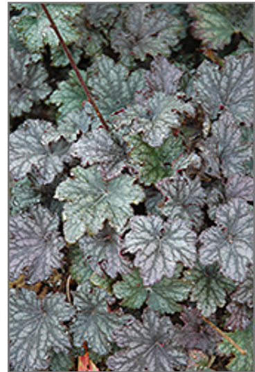
Frosted Violet Coral Bells foliage

This is a relatively low maintenance plant, and should be cut back in late fall in preparation for winter. It is a good choice for attracting hummingbirds to your yard. It has no significant negative characteristics.