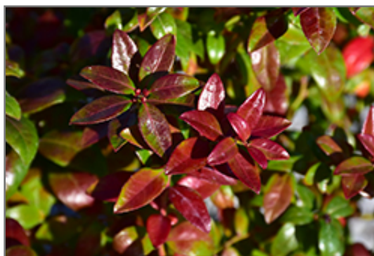
Blueberry Glaze Blueberry in fall

85 CHIEF JUSTICE CUSHING HWY SCITUATE, MA 02066 781-545-1266