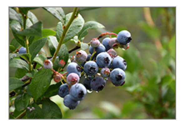
Bluetta Blueberry fruit

85 CHIEF JUSTICE CUSHING HWY SCITUATE, MA 02066 781-545-1266 www.kennedyscountrygardens.com