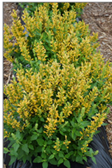
Poquito Butter Yellow Hyssop in bloom

85 CHIEF JUSTICE CUSHING HWY SCITUATE, MA 02066 781-545-1266