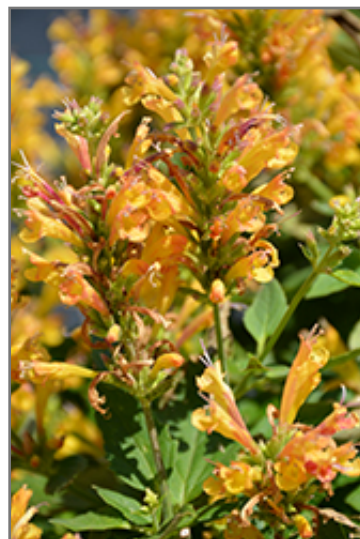
Poquito Butter Yellow Hyssop flowers

Poquito Butter Yellow Hyssop is recommended for the following landscape applications;