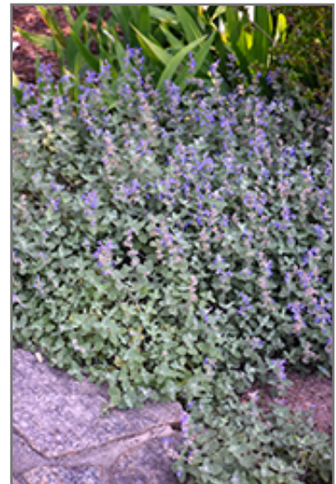
Early Bird Catmint in bloom