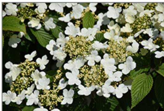
Wabi Sabi Doublefile Viburnum flowers

Wabi Sabi Doublefile Viburnum is a multi-stemmed deciduous shrub with a stunning habit of growth which features almost oriental horizontally-tiered branches. Its average texture blends into the landscape, but can be balanced by one or two finer or coarser trees or shrubs for an effective composition.