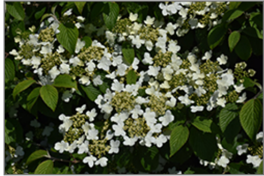
Wabi Sabi Doublefile Viburnum flowers