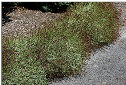
Little Angel Burnet in bloom