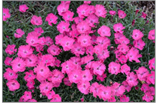
Vivid Bright Light Pinks flowers

Vivid Bright Light Pinks is recommended for the following landscape applications;