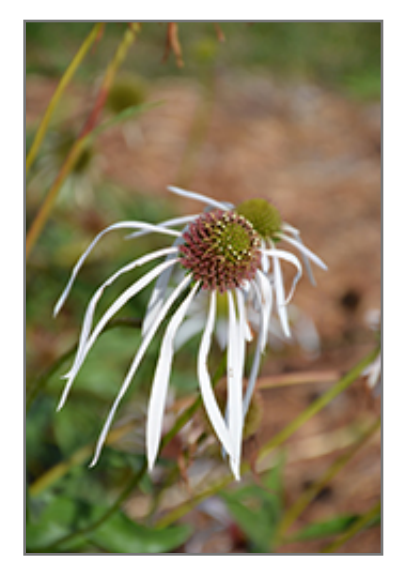
Hula Dancer Coneflower flowers

85 CHIEF JUSTICE CUSHING HWY SCITUATE, MA 02066 781-545-1266 www.kennedyscountrygardens.com