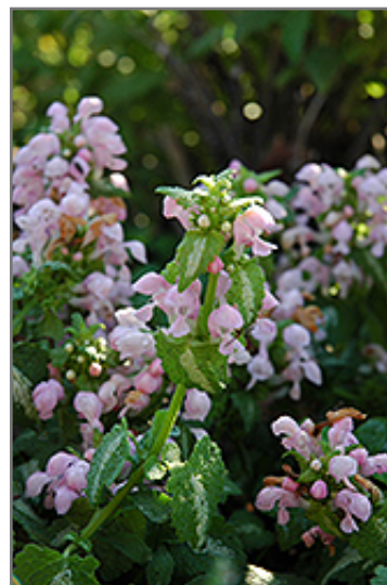
Shell Pink Spotted Dead Nettle flowers