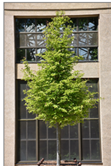
Persian Parrotia