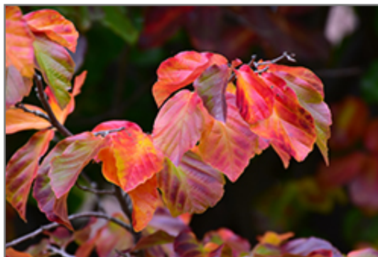
Persian Parrotia in fall Photo courtesy of NetPS Plant Finder