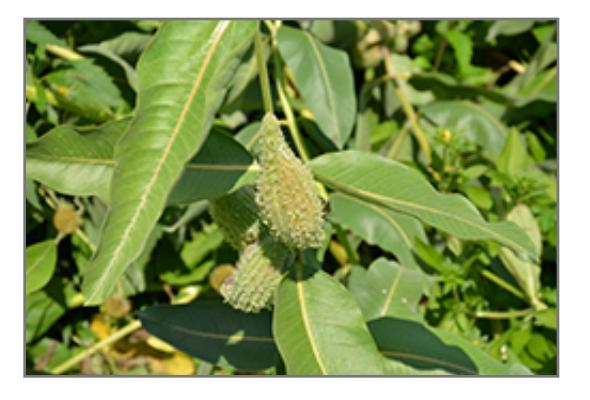
Showy Milkweed fruit

85 CHIEF JUSTICE CUSHING HWY SCITUATE, MA 02066 781-545-1266 www.kennedyscountrygardens.com