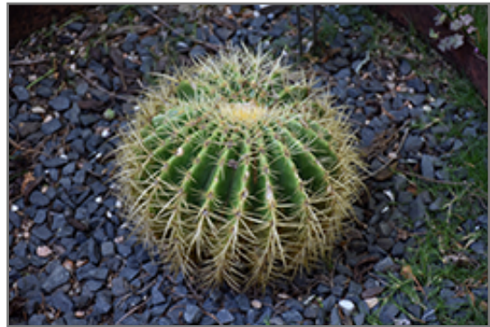
Golden Barrel Cactus

Golden Barrel Cactus is a succulent evergreen plant. It is a member of the cactus family, which are grown primarily for their characteristic shapes, their interesting features and textures, and their high tolerance for hot, dry growing environments. Like all cacti, it doesn't actually have leaves, but rather modified succulent stems that comprise the bulk of the plant, and which are designed to hold water for long periods of time. This particular cactus is valued for its distinctive barrel shape, and usually grows as a single spiny ribbed green stem. This plant has yellow cup-shaped flowers held atop the stems from late spring to early summer, which are interesting on close inspection.