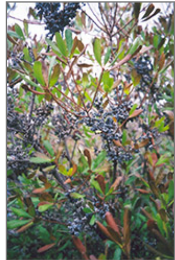
Northern Bayberry fruit

This shrub does best in full sun to partial shade. It does best in average to evenly moist conditions, but will not tolerate standing water. It is very fussy about its soil conditions and must have sandy, acidic soils to ensure success, and is subject to chlorosis (yellowing) of the foliage in alkaline soils, and is able to handle environmental salt. It is highly tolerant of urban pollution and will even thrive in inner city environments. This species is native to parts of North America.