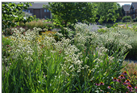
Rattlesnake Master in bloom

* This is a 'special order' plant - contact store for details