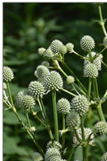
Rattlesnake Master flowers

This plant will require occasional maintenance and upkeep, and is best cleaned up in early spring before it resumes active growth for the season. It is a good choice for attracting bees and butterflies to your yard, but is not particularly attractive to deer who tend to leave it alone in favor of tastier treats. Gardeners should be aware of the following characteristic(s) that may warrant special consideration;