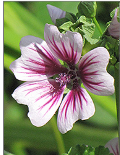
Zebrina Mallow flowers