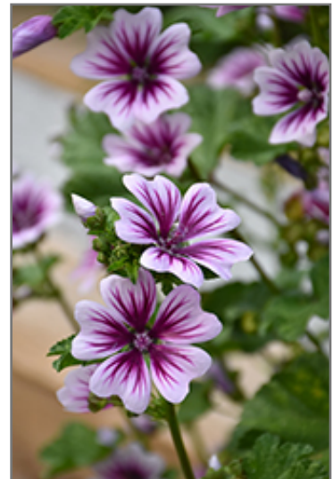
Zebrina Mallow flowers