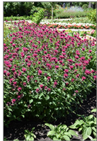
Raspberry Wine Beebalm in bloom