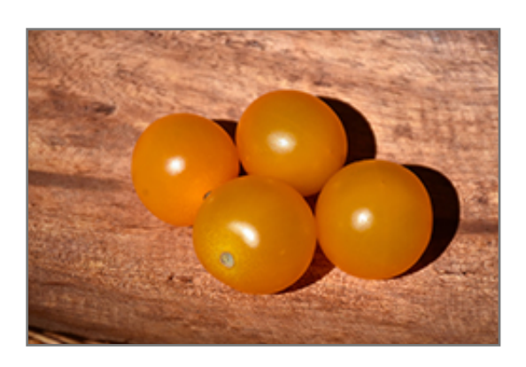
Sungold Tomato fruit

Sungold Tomato will grow to be about 3 feet tall at maturity, with a spread of 30 inches. When planted in rows, individual plants should be spaced approximately 3 feet apart. Because of its vigorous growth habit, it may require staking or supplemental support. This fast-growing vegetable plant is an annual, which means that it will grow for one season in your garden and then die after producing a crop.