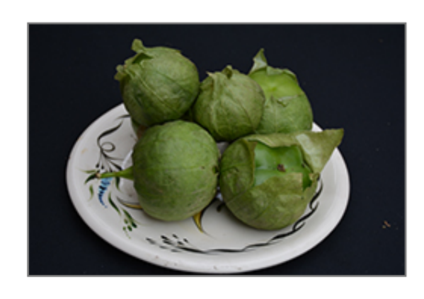
Tomatillo fruit

Tomatillo will grow to be about 5 feet tall at maturity, with a spread of 3 feet. When planted in rows, individual plants should be spaced approximately 3 feet apart. Because of its vigorous growth habit, it may require staking or supplemental support. This fast-growing vegetable plant is an annual, which means that it will grow for one season in your garden and then die after producing a crop.