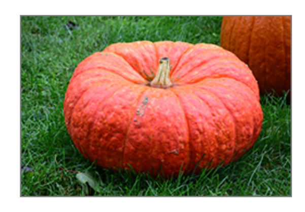
Rouge Vif d'Etampes Pumpkin fruit

Rouge Vif d'Etampes Pumpkin will grow to be about 18 inches tall at maturity, with a spread of 6 feet. When planted in rows, individual plants should be spaced approximately 3 feet apart. This vegetable plant is an annual, which means that it will grow for one season in your garden and then die after producing a crop.