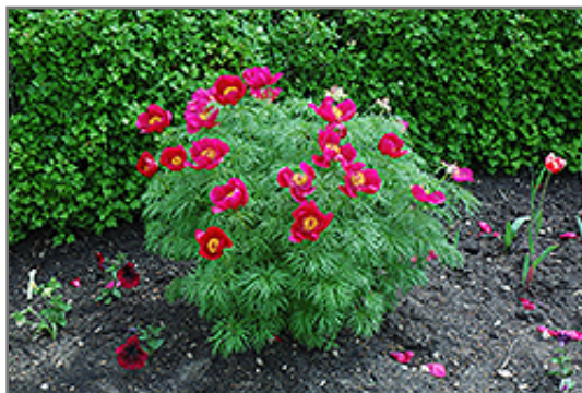
Fernleaf Peony in bloom