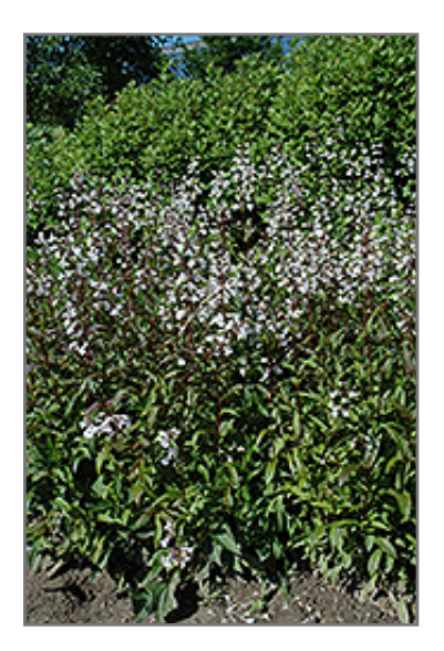
Husker Red Beard Tongue in bloom

This plant does best in full sun to partial shade. It prefers dry to average moisture levels with very well-drained soil, and will often die in standing water. It is considered to be drought-tolerant, and thus makes an ideal choice for a low-water garden or xeriscape application. It is not particular as to soil type or pH. It is somewhat tolerant of urban pollution. This is a selection of a native North American species. It can be propagated by cuttings; however, as a cultivated variety, be aware that it may be subject to certain restrictions or prohibitions on propagation.