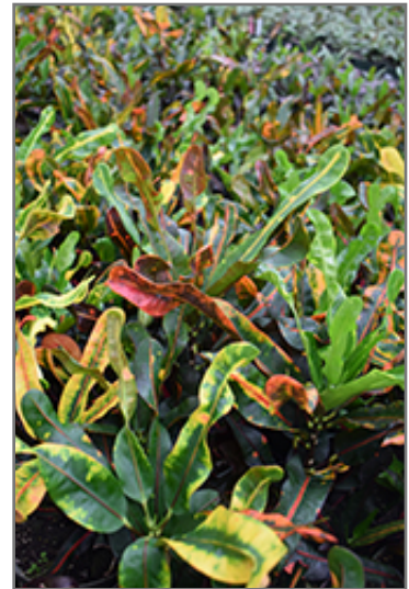
Mammy Croton in full

This is a dense herbaceous evergreen houseplant with an upright spreading habit of growth. Its wonderfully bold, coarse texture is quite ornamental and should be used to full effect. This plant should not require much pruning, except when necessary to keep it looking its best.