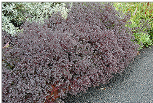
Bertram Anderson Stonecrop