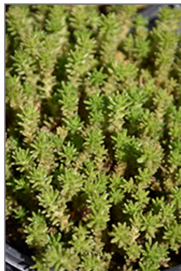
Six Row Stonecrop foliage

* This is a 'special order' plant - contact store for details