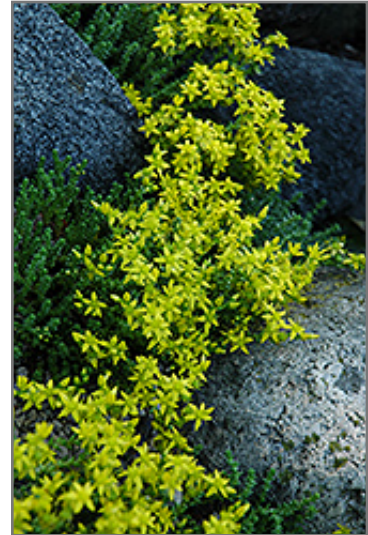
Six Row Stonecrop flowers