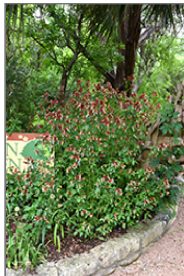
Fruit Cocktail Shrimp Plant in bloom