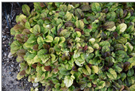
Feathered Friends Parrot Paradise Bugleweed