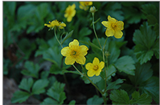
Barren Strawberry flowers