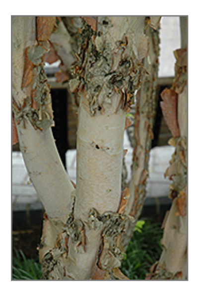
Fox Valley River Birch bark

85 CHIEF JUSTICE CUSHING HWY SCITUATE, MA 02066 781-545-1266 www.kennedyscountrygardens.com