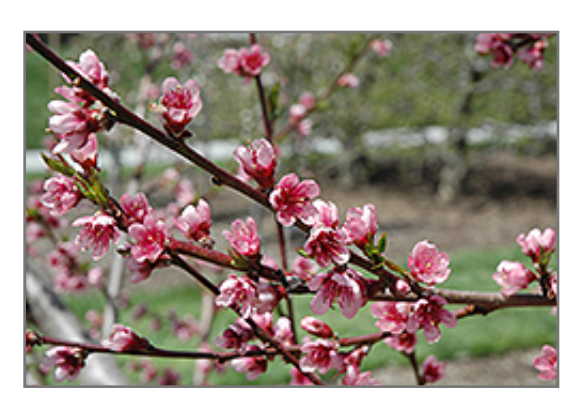
Reliance Peach flowers