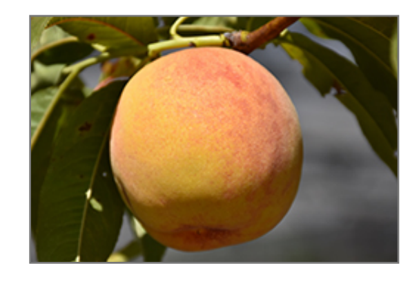
Reliance Peach fruit

Reliance Peach is clothed in stunning clusters of fragrant pink flowers along the branches in early spring, which emerge from distinctive rose flower buds before the leaves. It has dark green deciduous foliage. The narrow leaves turn yellow in fall. The fruits are showy yellow drupes with a red blush, which are carried in abundance in mid summer. The fruit can be messy if allowed to drop on the lawn or walkways, and may require occasional clean-up.