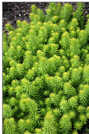
Prima Angelina Stonecrop

Prima Angelina Stonecrop is recommended for the following landscape applications;