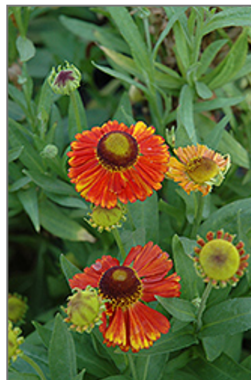
Sahin's Early Flowerer Sneezeweed flowers

This plant will require occasional maintenance and upkeep, and should be cut back in late fall in preparation for winter. It is a good choice for attracting butterflies to your yard, but is not particularly attractive to deer who tend to leave it alone in favor of tastier treats. Gardeners should be aware of the following characteristic(s) that may warrant special consideration;