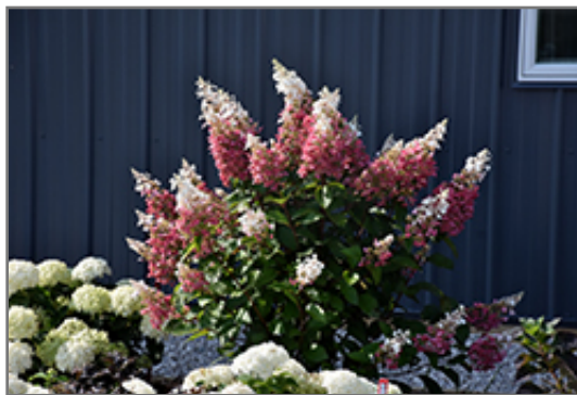
Pinky Winky Hydrangea in bloom