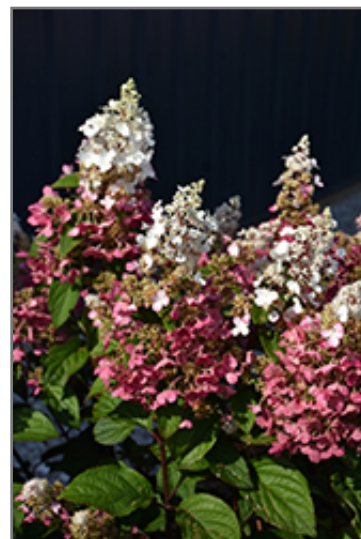
Pinky Winky Hydrangea flowers